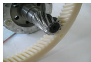
Helical gear system ensures linear torque on brush drive