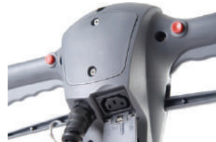
Fibre glass reinforced PVC handle with integrated accessory power socket