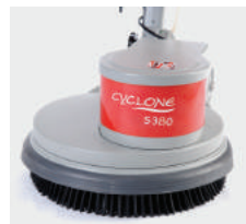
Low profile motor and separate capacitor housing for better cooling

At the heart of these machines are custom made class H (180° C) rated insulation, dust sealed, maintenance free motors that assure long service life. These are mounted off-centre to offset brush torque and provide optimal balancing, thus minimizing operator fatigue. Power transfer is gear-driven for greater traction and efficiency.