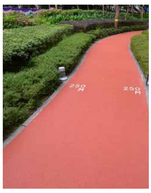
Walking and jogging path