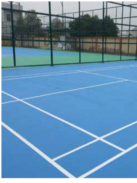
Flexipave Patching Compound